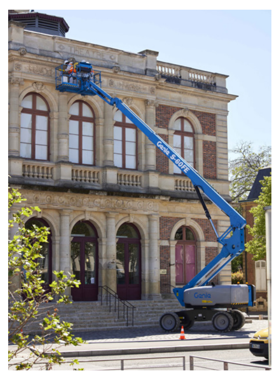
Low Noise, Low Emissions